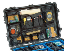
1659 Photo/Lid Organizer