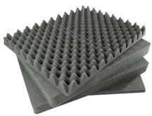
1651 4 pc. Replacement Foam Set