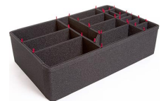
1650EUTP TrekPak Case Divider Kit