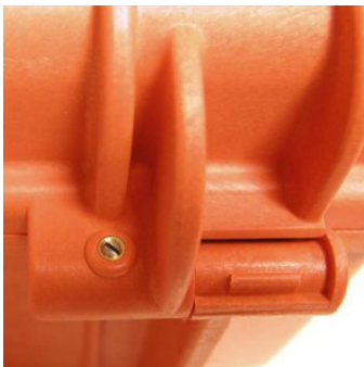
LID CAN BE SET TO SLIDE-OFF By releasing the back screw, lid becomes set to slide-off when opened at 70°