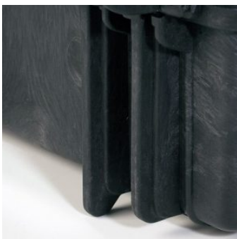
COUNTERBALANCE SUPPORTS (in certain models)